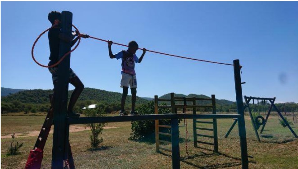
Learning to balance

We would like to extend our utmost gratitude towards each and every donor/funder for the continuous support. We would also like to encourage our donors and funders to please keep on supporting the Trust and ultimately the NPC, without your support the Trust cannot keep on doing what it was intended to do.