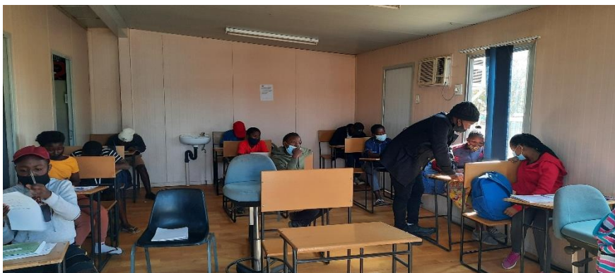
Classroom learning during Lockdown.