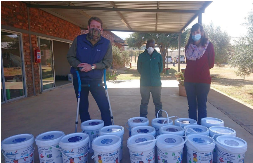
Food buckets for the needy